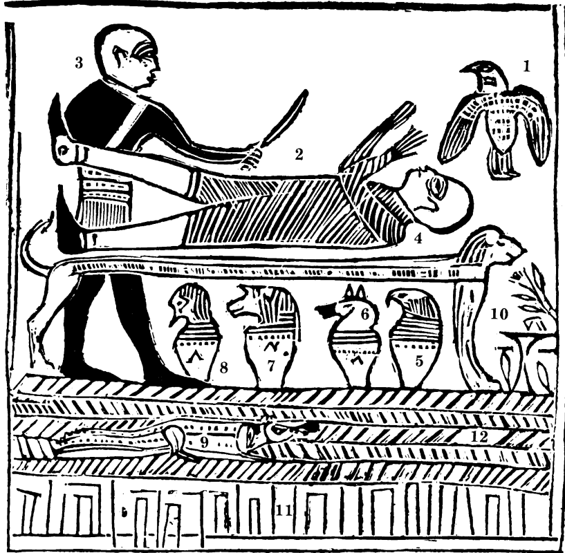
EXPLANATION OF THE ABOVE CUT.