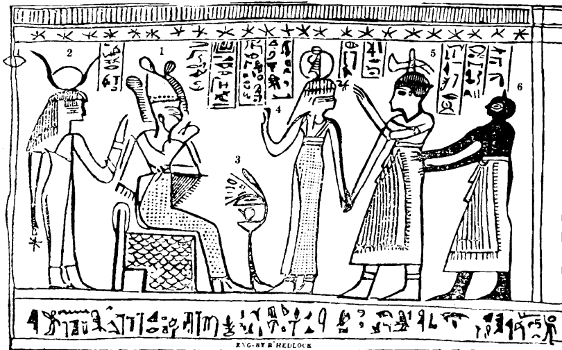
Explanation of the above cut.

FIG. 1. Abraham sitting upon Pharaoh's throne, by the politeness of the king, with a crown upon his head representing the priesthood, as emblematical of the grand presidency in heaven with the scepter of justice and judgment in his hand.